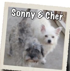
Sonny & Cher