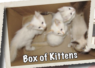
Box of Kittens