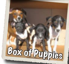
Box of Puppies